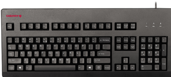
Models may vary from the image shown